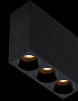
BLACK/BLACK HIGH GLOSS