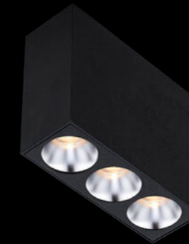
BLACK/SILVER HIGH GLOSS